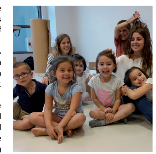
76 children participated in this year's workshops. 65% more than last year.

This year, several monitors were sons or daughters of people who work at