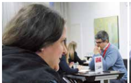
NEWS AND UPDATES < ULMA Group at the Be Basque Talent Conference employment forum